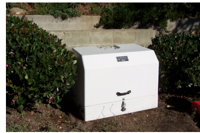
Stormwater monitoring stations can be housed in small, locking weather-proof enclosures.

To complete the package, the system allows for Short Message Service (SMS), also referred to as texts, which includes alarms and current status updates. For example, field crews can send SMS messages to the flowmeter, requesting current status. The flowmeter will then respond with battery voltage, current flow rate and rainfall totals sent to a single cell phone. This feature results in additional cost savings since cellular-enabled field crews will not require laptops or an